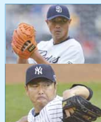
Proudly serving athletes like former Padres pitcher Akinori Otsuka.