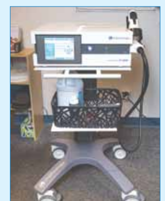
ESWT offers a cutting-edge method for chronic pain relief.