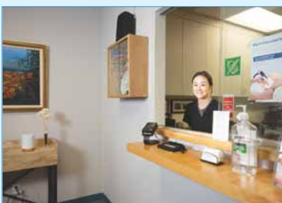
A comfortable and serene waiting area and reception section. The clinic is conveniently located in Kearny Mesa.