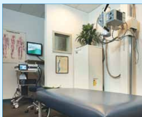
The treatment rooms are equipped with advanced tools like X-rays and ESWT for complete care.